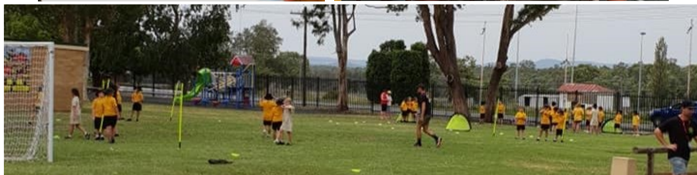
What a great first day for 2019 at Cessnock PS! We have our friends from Motiv8sports Newcastle on site doing physical challenges and team building activities with all students and staff in Years 1-6! Since when has the first day of school been so much fun?