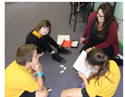
3/6H doing great work during their TEN lesson!!